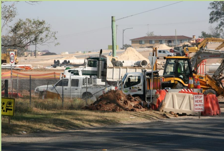
Riverstone Infrastructure works have commenced for new housing.

Being located on Hamilton Street which is a proposed collector road the site is conveniently accessible to the Riverstone area and also major roadways connecting to both Vineyard and Riverstone East.