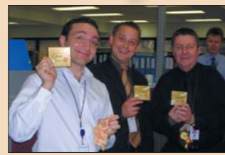
85% cocoa not a good idea for these three!