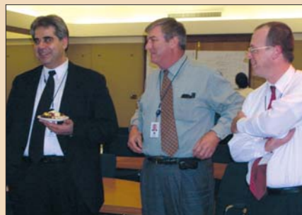
Yummy yummy yummy. Tummy tummy tummy!